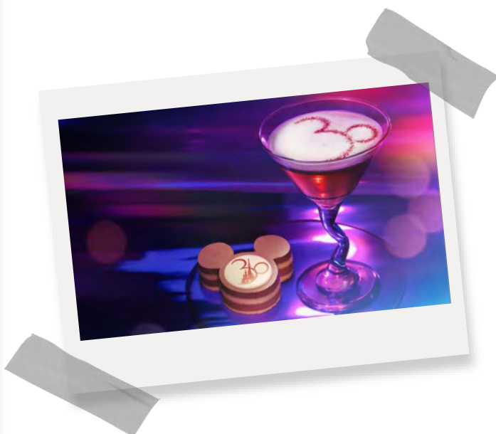
Table-service restaurants will feature iconic new desserts developed by the pastry team, composed of chefs, sous chef and commis, who works in the inside-Disneyland Paris’ pastry Les Délices de Minnie . It includes a white chocolate and strawberry cake served under a dome called “Le Bouquet final”, and all-you-can-eat buffets will feature a new 30 th Anniversary-themed macarons assortment that will be a feast for the eyes and a delight for the taste buds of Guests of all ages.

The Disneyland Paris barman team, has, on his side, created exclusive drinks, such as the pink “Happy Birthday Cocktail”, or the “Smoothie with a twist” composed of blueberries purees, banana and coconut, or even the blue “Enchanted Flute”